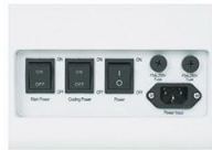
Independent Power Switch