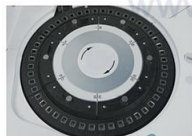
Reaction Tray 37±0.2°C, real-time monitor.