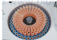
Reagent Tray Refrigerated tray with independent switch.