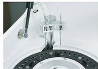
Washing Probe Independent 3-step washing system.