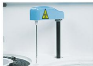
Sample&Reagent Probe Liquid level sensor function. Anti-collision function. Reagent volume real-time detection.